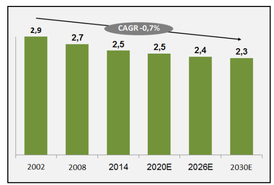
Average family size/ number of people

Given this facts, the AECC has set its own challenges for the coming years, such as to ensure the volunteering work as a part of the comprehensive care to the patient and family, demanding equal access to volunteering services, and expand the integration model beyond hospitals allowing greater proximity to wherever the cancer patient may be.